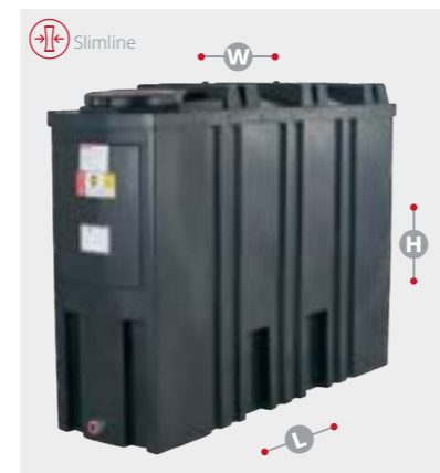
SL1400BT W 660mm H 1695mm L 2140mm

Nominal Capacity: 1235 Litres Brimful Capacity: 1238 Litres Tank Footprint: 610mm x 1860mm Weight: 155 kgs