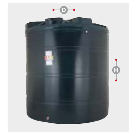
V9200BT D 2510mm H 2800mm

Nominal Capacity: 5000 Litres Brimful Capacity: 5216 Litres Tank Footprint: 2060mm Weight: 265 kgs