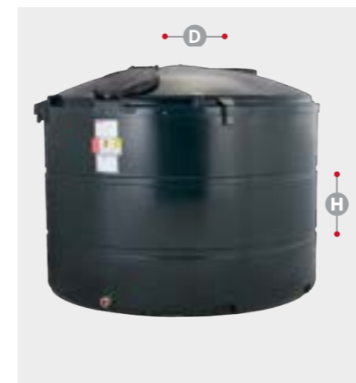
V3500BT D 2120mm H 1600mm

Nominal Capacity: 2350 Litres Brimful Capacity: 2448 Litres Tank Footprint: 1650mm Weight: 155 kgs