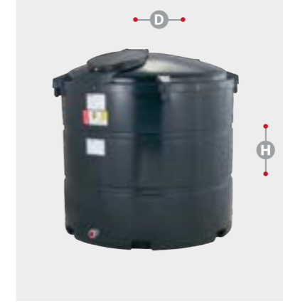
V1340BT D 1410mm H 1530mm

Nominal Capacity: 1230 Litres Brimful Capacity: 1234 Litres Tank Footprint: 1230mm Weight: 96 kgs