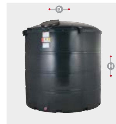
V5000BT D 2120mm H 2300mm

Nominal Capacity: 3500 Litres Brimful Capacity: 3661 Litres Tank Footprint: 2060mm Weight: 195 kgs