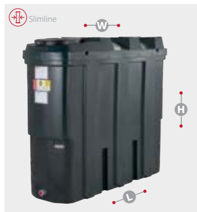
SL1235BT W 650mm H 1660mm L 2000mm

Nominal Capacity: 1000 Litres Brimful Capacity: 1024 Litres Tank Footprint: 610mm x 1860mm Weight: 125 kgs