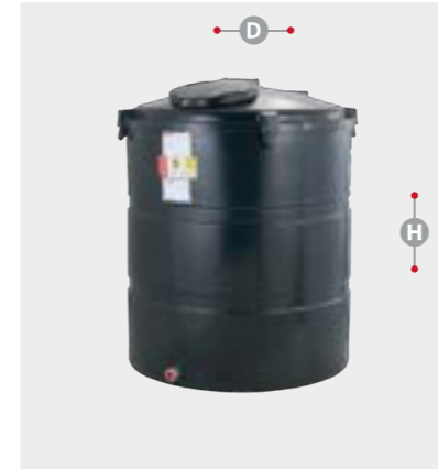
V1230BT D 1250mm H 1600mm

Nominal Capacity: 1230 Litres Brimful Capacity: 1234 Litres Tank Footprint: 1230mm Weight: 96 kgs