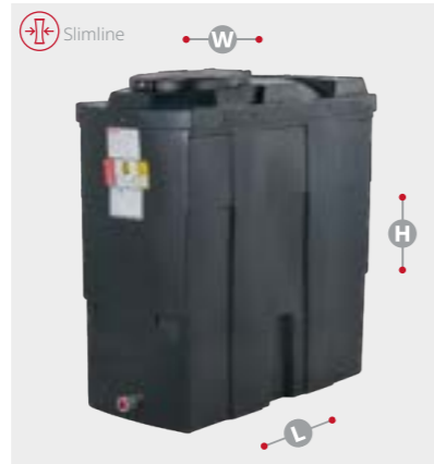
SL650BT W 630mm H 1350mm L 1300mm

Nominal Capacity: 650 Litres Brimful Capacity: 703 Litres Tank Footprint: 605mm x 1170mm Weight: 100 kgs