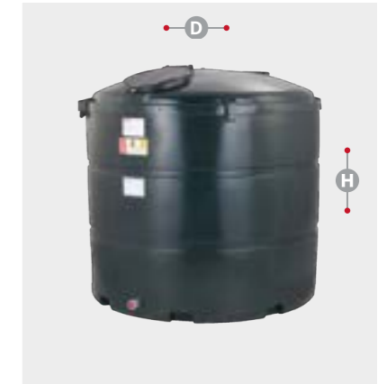
V2350BT D 1710mm H 1650mm

Nominal Capacity: 1340 Litres Brimful Capacity: 1369 Litres Tank Footprint: 1390mm Weight: 107 kgs