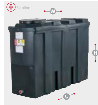
SL1000BT W 645mm H 1340mm L 1890mm

Nominal Capacity: 650 Litres Brimful Capacity: 703 Litres Tank Footprint: 605mm x 1170mm Weight: 100 kgs